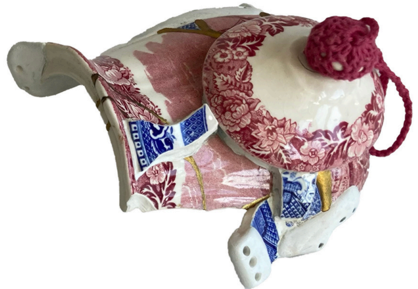
02. Poiesis of Weathering _breasts, 2023, Ceramic, golden glue, crochet, earth strong magnets, 17 x 16 x 4 and 16 x 13 x 9 cm