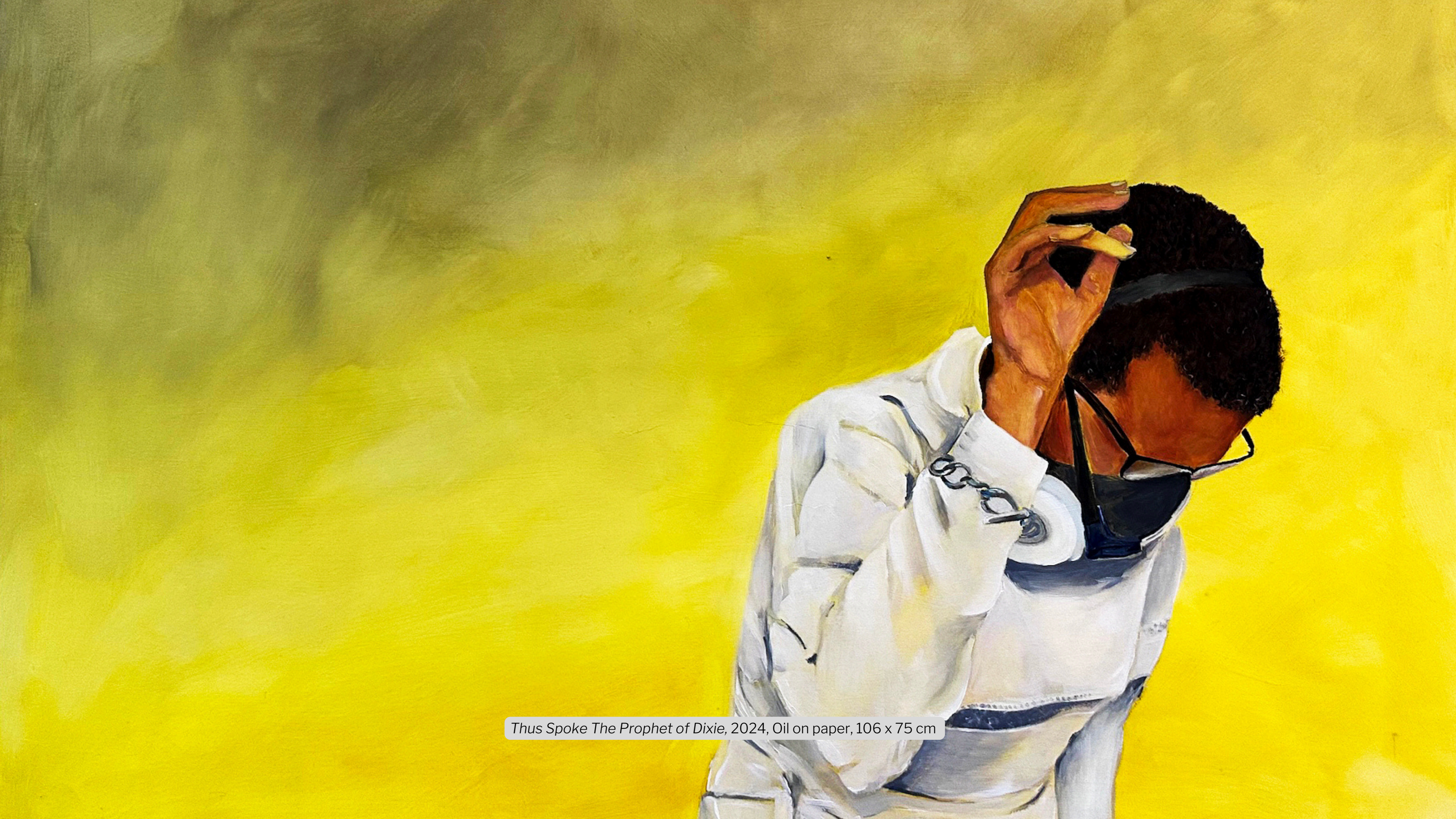
Thus Spoke The Prophet of Dixie , 2024, Oil on paper, 106 x 75 cm