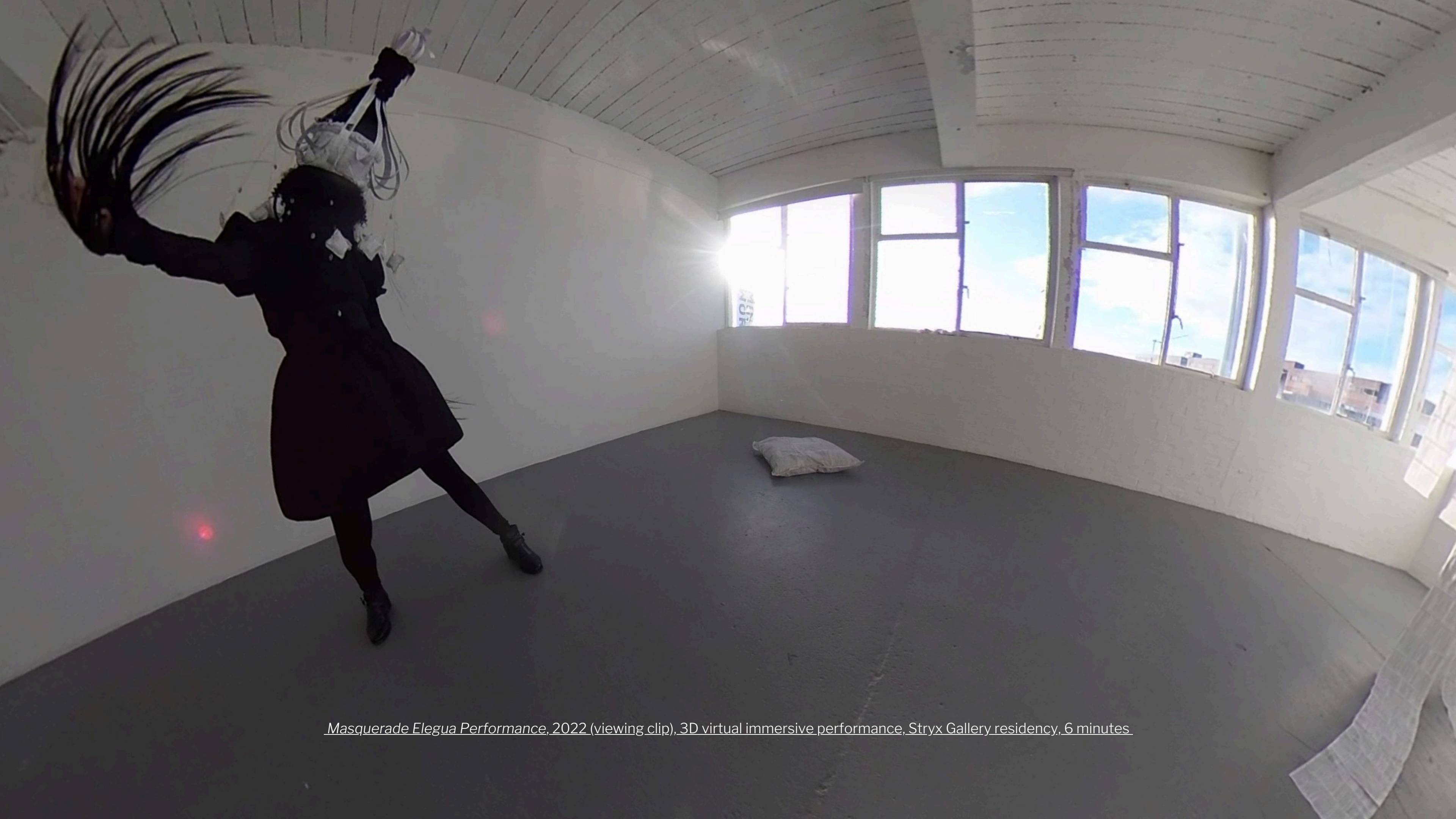
Masquerade Elegua Performance, 2022 (viewing clip), 3D virtual immersive performance, Stryx Gallery residency, 6 minutes