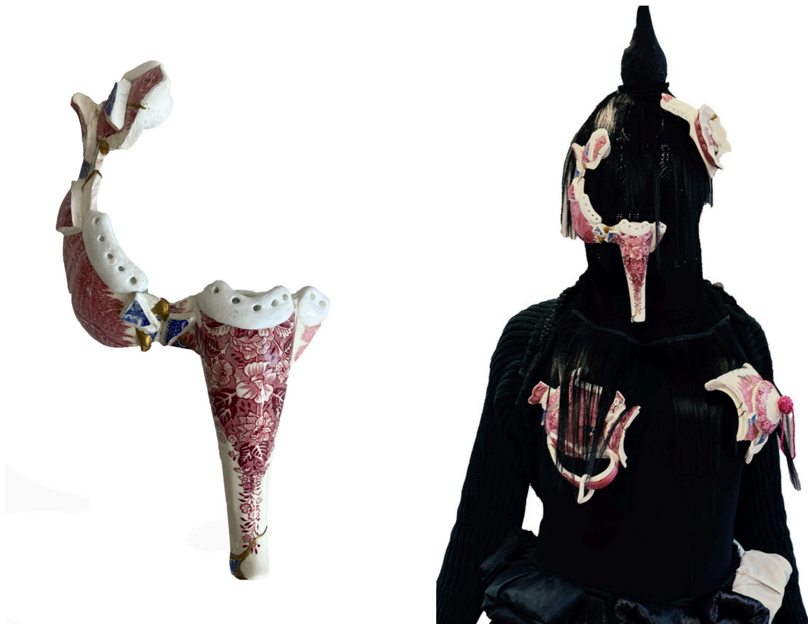
01. Poiesis of Weathering _ nose 2023. Ceramic, golden glue, earth strong magnets. 13 x 24 x 13 cm